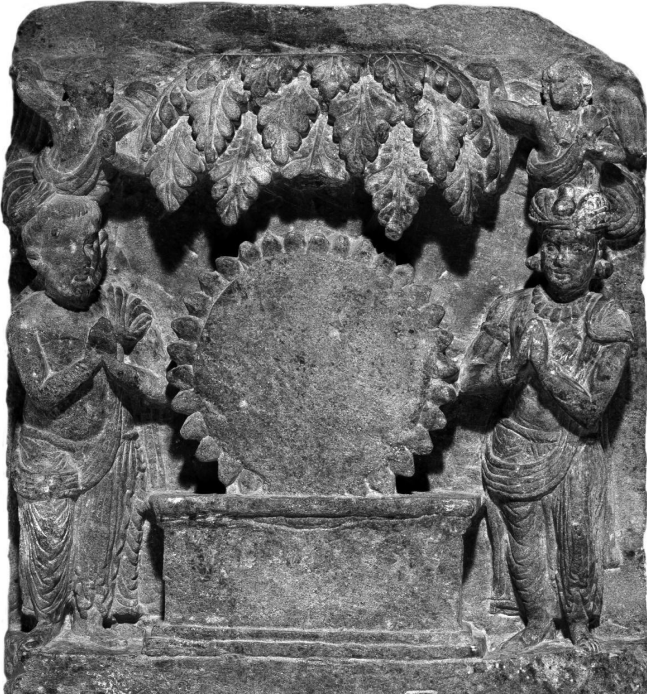
Plate 1 The Entreaty to Teach the Dharma Gandhara