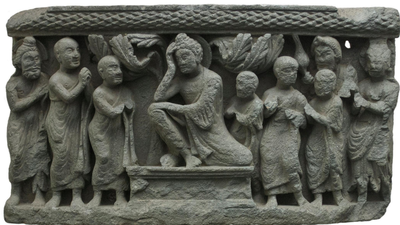
Plate 2 The Pensive Buddha is Being Requested to Teach Gandhara